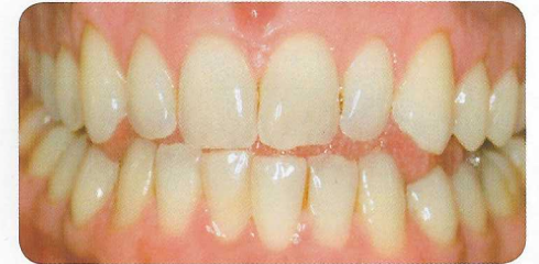
Before Opalescence whitening treatment

Wondering if you're a good candidate? Just ask your dentist!